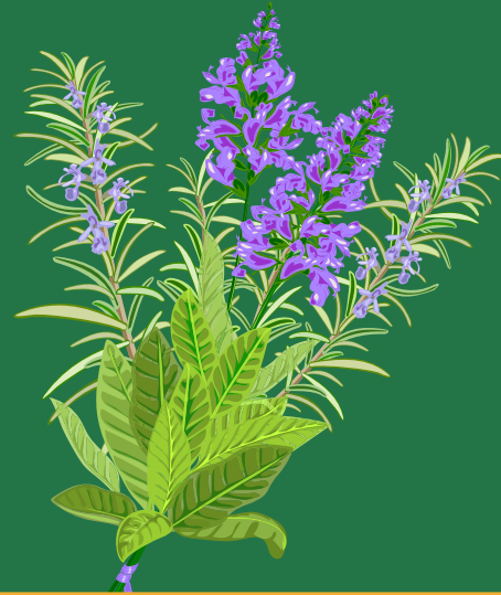
Meley Blue Sage